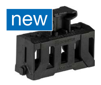
ESO Fuse Inserter/Extractor (part of the delivery) Order required accessories separately

Fuse Inserter/Extractor with Cover Function for 10.3x38 mm Fuses in Clips, Patent Pending